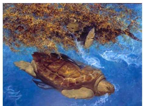
Work by Stanley Meltzoff

Thirty of Meltzoff's original paintings will be included in The Great Sporting Fish exhibit which is partially sponsored by grants from Hilton Head Island and Beaufort County Accommodations Tax and