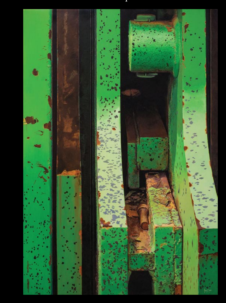
Through November 12, 2016

1224 Lincoln Street - Columbia, SC 29201 - 803.252.3613 - cityartonline.com