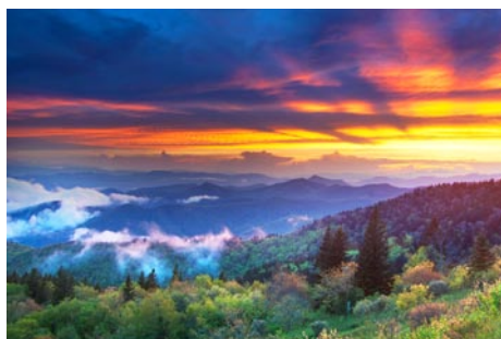
Work by Susan Stanton

"Yes, there are moments of serendipity when the elements are aligned for that perfect photo, but discovering those magical, intimate details of my subjects is the quintessence of my photography," adds Stanton.