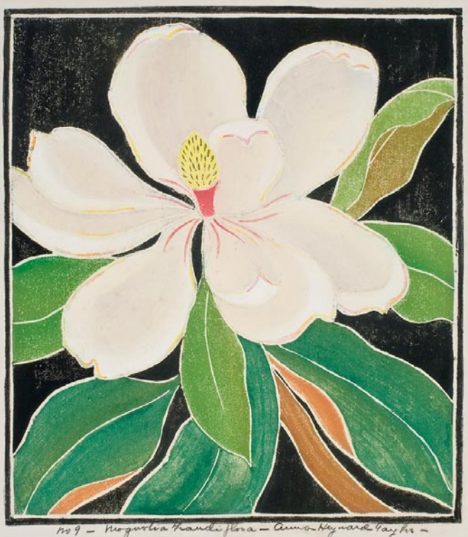
Magnolia Grandiflora, No. 9, work on paper, courtesy of Gibbes Museum of Art

"Anna Heyward Taylor has a special place at the Columbia Museum of Art, where our collection is home to more than thirty of her works, including watercolors, prints, and drawings. With close ties to the artist's family for more than six decades, the Museum celebrates the publication of this monumental volume of letters