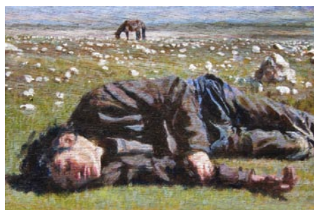
Work by Hamad Hahmoodi

For further information contact the Black Mountain Center for the Arts at 828/669-0930.