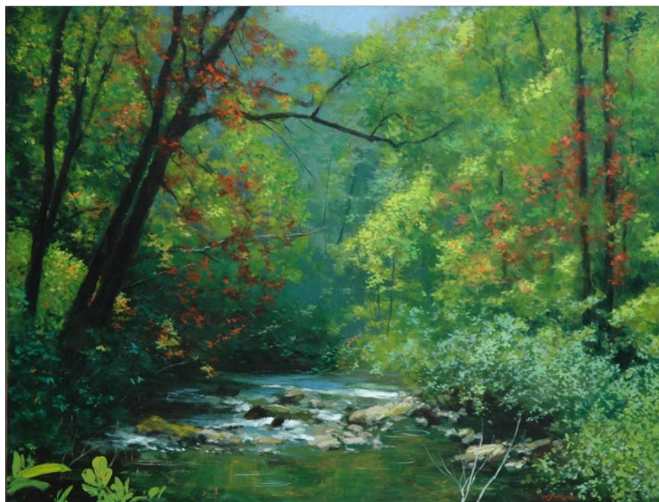
Late Summer on the Chattooga River

SAM is funded in part by The Arts Partnership and its donors, the County and City of Spartanburg, the South Carolina Arts Commission which receives support from the National Endowment for the Arts, The George Ernest Burwell, Jr. Fund, The Jean Erwin Fund, The Lucile F. Kohler Fund for the Spartanburg Art Museum, and the Annual Art & Antique Show.