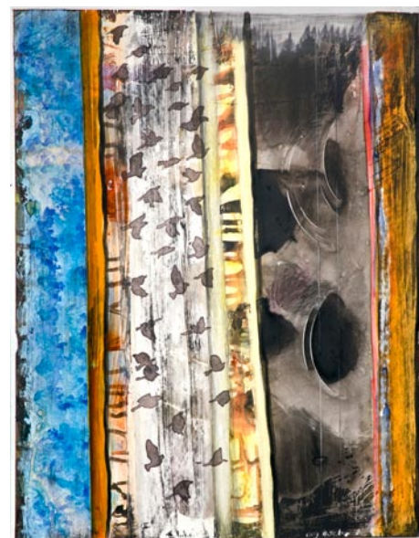
Work by Alix Hitchcock

Institutional Gallery listings, call the gallery at 336/723-5890 or visit ( www.Artworks-Gallery.org ).