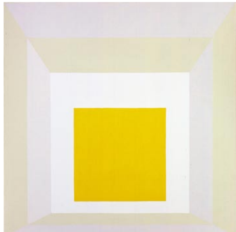
Josef Albers, Homage to the Square - Insert , 1959, acrylic on fiberboard, Smithsonian American Art Museum, Gift of S.C. Johnson & Son, Inc.

Many of the country's leading artists had begun to paint or sculpt in the 1930s as beneficiaries of WPA-era government support. Others were immigrants who fled to the United States as Nazi power grew in Germany. Some were highly educated; others abandoned school at an early age to pursue lives as artists. Working in New York, California, the South, and abroad, they probed human experience and the value of rational systems in the creative process. They blended knowledge gleaned from old master art, the modernism of Picasso and Matisse, Jungian and Existential philosophy, and Greek and Roman mythology in abstract compositions that addressed current social concerns and personal history. Mixing hardware-store paint with expensive artist colors and bits of paper torn from magazines, they linked their work with contemporary life. Aided in their efforts by a group of young dealers, prominent critics, and the influential editor of Art News magazine, abstract artists gained credibility. No longer dismissed as irrelevant or incomprehensible, abstraction became a widely discussed national style.