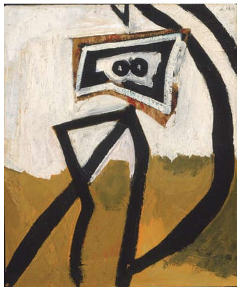
Robert Motherwell, Figure in Black (Girl with Stripes) , 1947, oil and paper on fiberboard, Smithsonian American Art Museum, Gift of the Dedalus Foundation and museum purchase, ©1994 Dedalus Foundation

"New Images of Man" includes Nathan Oliveira, Romare Bearden, Larry Rivers, Jim Dine, David Driskell, and Grace Hartigan, each of whom searched their surroundings and personal lives for vignettes emblematic of larger universal concerns.