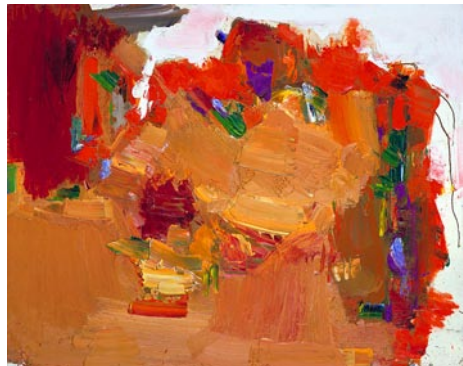
Hans Hofmann, Fermented Soil , 1965, oil, Smithsonian American Art Museum, Gift of S.C. Johnson & Son, Inc.

Many of the country's leading artists had begun to paint or sculpt in the 1930s as beneficiaries of WPA-era government support. Others were immigrants who fled to the United States as Nazi power grew in Germany. Some were highly educated; others abandoned school at an early age to pursue lives as artists. Working in New York, California, the South, and abroad, they probed human experience and the value of rational systems in the creative process. They blended knowledge gleaned from old master art, the modernism of Picasso and Matisse, Jungian and Existential philosophy, and Greek and Roman mythology in abstract compositions that addressed current social concerns and personal history. Mixing hardware-store paint with expensive artist colors and bits of paper torn from magazines, they linked their work with contemporary life. Aided in their efforts by a group of young dealers, prominent critics, and the influential editor of Art News magazine, abstract artists gained credibility. No longer dismissed as irrelevant or incomprehensible, abstraction became a widely discussed national style.