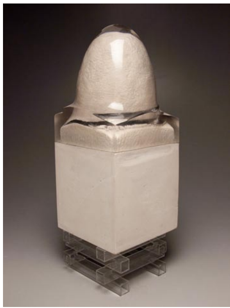
Work by Phillip Ashe Central Carolina Community College (CCCC) and are an exploration of odd

juxtapositions of material, both synthetic and natural, as metaphor.