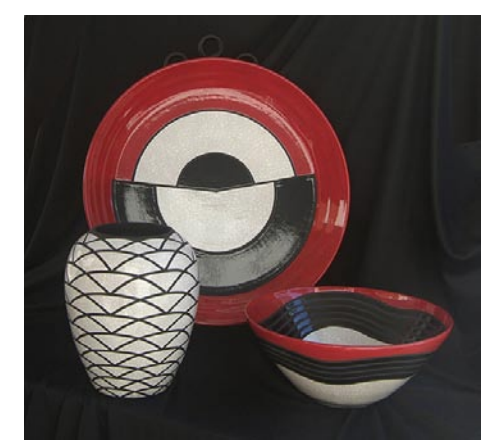
Work by Charles Chrisco

contemporary and sophisticated pieces, yet the work is so classic it blends beautifully into every environment."