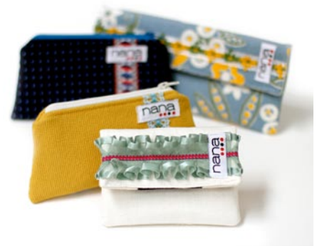
Works by Nana by Sally, LLC.

From Chattanooga, TN, comes another new Crafty Feast vendor, Sweetcycle Apparel. This particular vendor has a wonderfully crafty back-story: Sweetcycle Apparel was born in Kenmare, Ireland, during an extended backpacking trip. Necessity to be creative with whatever they had or were able to find forced SweetCy-