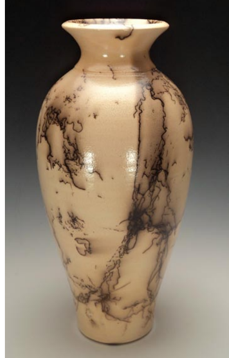
Work from Turn & Burn Pottery

The weekend begins with the Celebration Gala on Friday, Nov. 16, from 6-9pm, which includes a catered reception, live music, and the collaborative works auction. The Celebration continues on Saturday, Nov. 17, from 9am-6pm, with a silent auction, from 1-3pm, and Sunday, 10am-4pm.