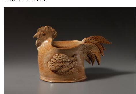
Work from Thomas Pottery

Volunteers serve as the backbone of the festival. We strive to provide Celebration attendees the finest experience possible, warmly welcoming them to spend a leisurely time browsing and shopping, seeing the process, developing and renewing relationships with the potters of Seagrove. This would not be possible without the immense dedication of our volunteers, including members from the Asheboro City Council, The Randolph Arts Guild, auctioneers, educators, pottery lovers and collectors. We are always looking for ways to build on this essential team. Volunteers have the opportunity to work on many aspects of the festival, including the auctions, artist relations, gala preview event, production, special projects and more. Contact Bonnie Burns by e-mail at (volunteers@celebrationofseagrovepotters.com), (redhare@rtmc.net) or call 336/953-549