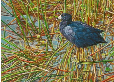
Work by Wes Siegrist

The Yadkin Arts Council in Yadkinville, NC, will present the exhibit, The World in Miniature, Exquisitely, a national touring exhibition of all new works in miniature by the internationally acclaimed husband wife duo of Wes and Rachelle Siegrist, on view in the Welborn Gallery from Nov. 16 through Dec. 22, 2012, A reception will be held on Nov. 16, beginning at 5:30pm. The popular artists will be present at the opening where they will debut 51 new paintings.