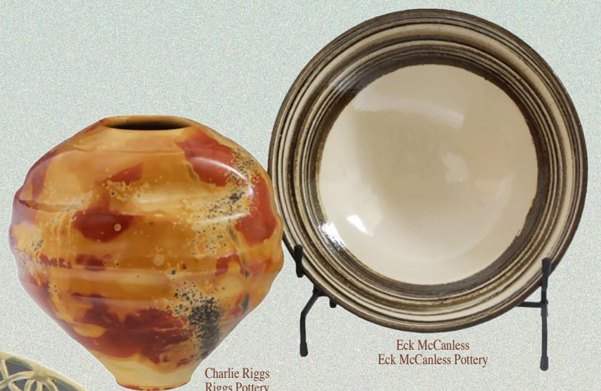
Charlie Riggs Riggs Pottery