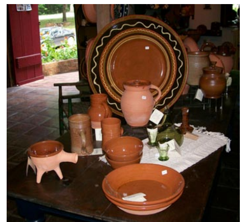
Works from Westmore Pottery