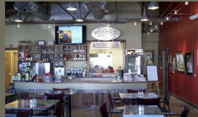
Café open for dinner before theatre events