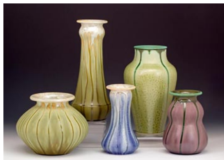
Works from Bulldog Pottery

Volunteers serve as the backbone of the festival. We strive to provide Celebration attendees the finest experience possible, warmly welcoming them to spend a leisurely time browsing and shopping, seeing the process, developing and renewing relationships with the potters of Seagrove. This would not be possible without the immense dedication of our volunteers, including members from the Asheboro City Council, The Randolph Arts Guild, auctioneers, educators, pottery lovers and collectors. We are always looking for ways to build on this essential team. Volunteers have the opportunity to work on many aspects of the festival, including the auctions, artist relations, gala preview event, production, special projects and more. Contact Bonnie Burns at (volunteers@celebrationofseagrovepotters.com), (redhare@rtmc.net) or call 336/953-5491.