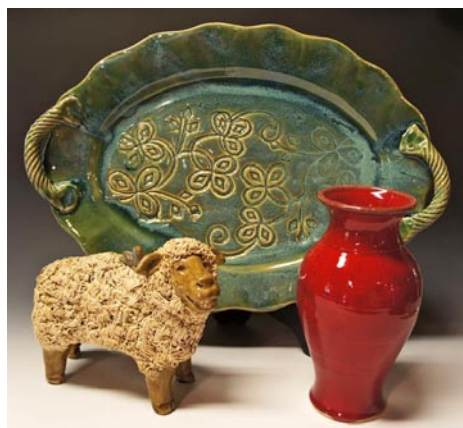
Works from Crystal King Pottery

The event kicks off with the opening night Gala. Guests can peruse and purchase first picks from the booths, while enjoying locally catered food and beverages, live music and enjoy the opportunity to view and bid on collaborative, one-of-a-kind, collectable pottery pieces.