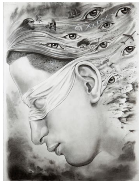
Work by Ben Perini

This current work by Perini - a collection titled "Random Thoughts and the Fictional Portrait" - consist of thoughtful imagery