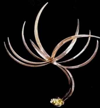
Dancer Series Two