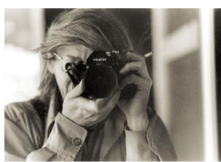
Work by John Menapace

Collective Arts Gallery & Ceramic Supply, 8801 Leadmine Road, Suite 103, Raleigh. Ongoing - Featuring works by local and nationally renowned artists on permanent exhibit. Hours: Tue.-Fri. 11am-7pm & Sat., 10am-6pm. Contact: 919/844-0765.