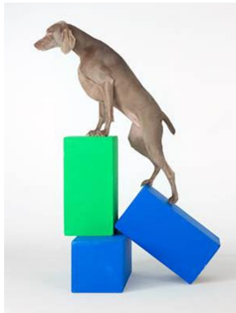
Work by William Wegman