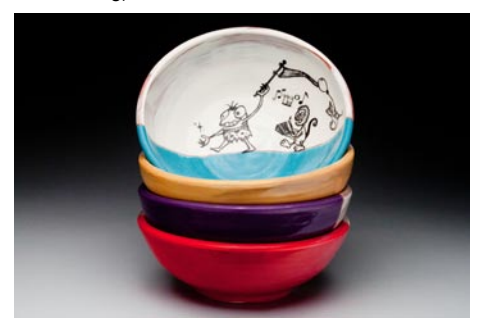
Works by Erik Haagensen

Ackland Art Museum, UNC - Chapel Hill, Columbia & Franklin Streets, Chapel Hill. Through Dec. 31 - "Highlights from the Permanent Collection." The Ackland Art Museum presents a major reinstallation of highlights from its diverse permanent collection of over 17,000 works of art. The first presentations include The Western Tradition, from Ancient art to twentieth-century art; Art from West Africa; Art from China and Japan; and Art from Southern and Western Asia. Museum Store Gallery (Franklin and Columbia Street), Store hours: Mon.-Sat., 10am-5:30pm & Sun., noon-5-pm. Museum Hours: Wed.-Sat., 10am-5pm and Sun., 1-5pm. Contact: 919/966-5736 or at (www. ackland.org).