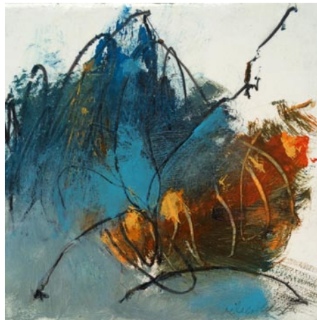
Work by Eileen Blyth

Pat Gilmartin is continuing to work with glass mosaics and fused glass. For Vista Lights she will have several new pieces to show, including an intricately patterned mosaic gazing ball. She also has some new additions to her popular series of small, sculptured ceramic faces.