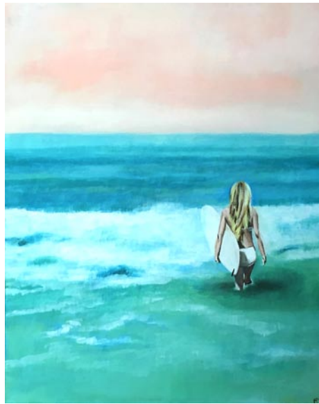
Work by Cory McBee

The North Charleston City Gallery is situated in two corridors of the northwest corner of the Charleston Area Con-