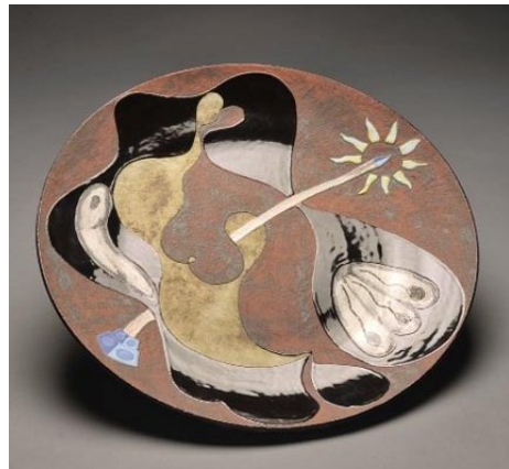
Work by Johnny Nutt

"While I occasionally use some source imagery for my designs, such as sub-cellular structures, seed, leaf, and pollen forms, satellite photography and fluid-systems, I tend to abstract that imagery to the point of non-objectivity. I have no real interest in reality. If it already exists in the world, I see no need to rehash it. I prefer to make new stuff. I use very simple glazing techniques, usually limited to terra sigillata and a small amount of glaze."