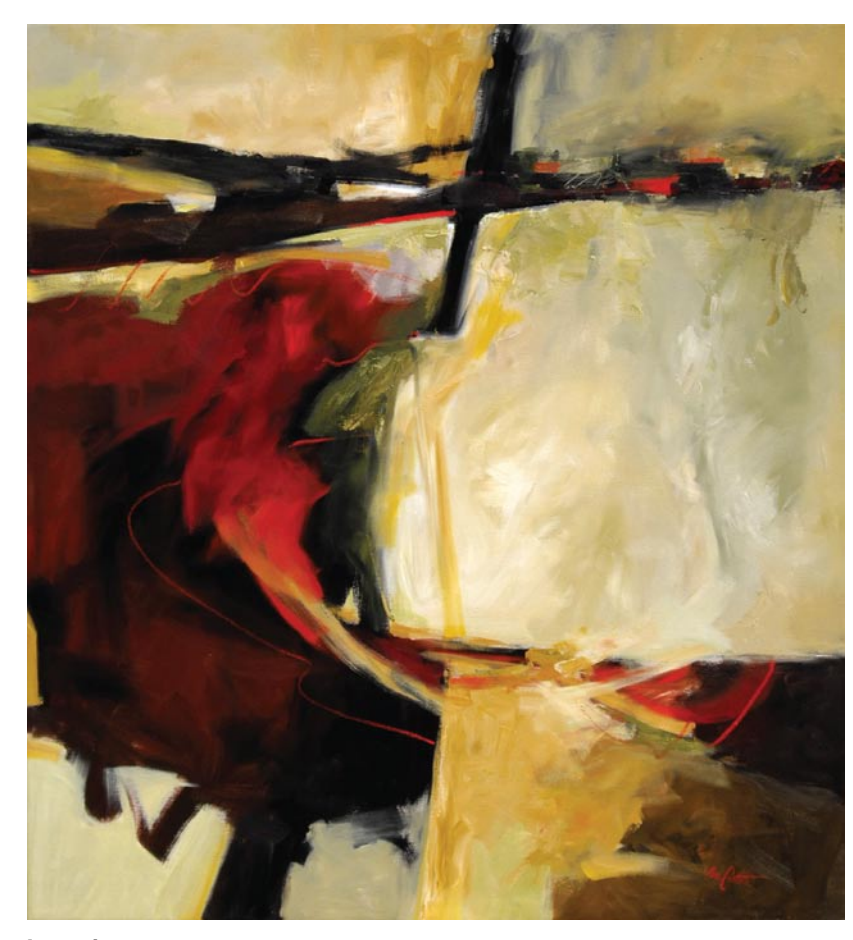
Intention Oil on Canvas, 72 x 66 inches

The Halsey Institute of Contemporary Art is administered by the School of the Arts at the College of Charleston and exists to advocate, exhibit and interpret visual art, with an emphasis on contemporary art. For further information check our SC Institutional Gallery listings, call the Institute at 843/953-4422 or visit (www.halsey.cofc. edu).