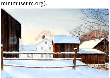
Blue Ridge Sunrise by Jack Greenfield

The Mint Museum Uptown, located in the Levine Center for the Arts in Charlotte, NC, is presenting the exhibit, VantagePoint X / Vik Muniz: Garbage Matters , on view through Feb. 24, 2013. Combining three-dimensional elements within a two-dimensional pictorial space to create visually and conceptually loaded images, Vik Muniz creates work that fosters a shift in visual perception as well as cultural preconceptions. For more info check our NC Institutional Gallery listings, call 704/337-2000 or visit (www.