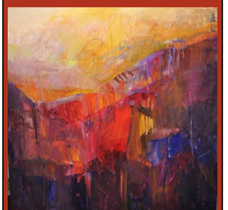
Summer Heat, oil on canvas