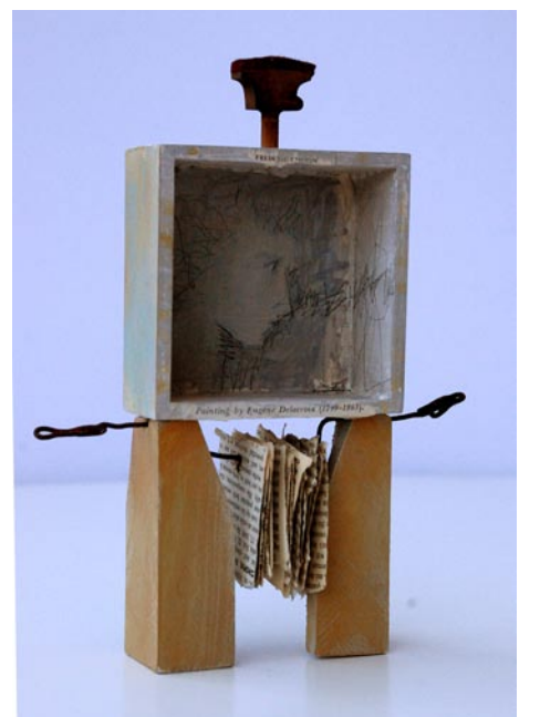
Work by Eileen Blyth

The Curtis R. Harley Art Gallery is located on the first floor lobby of the Humanities and Performing Arts Center (HPAC). The