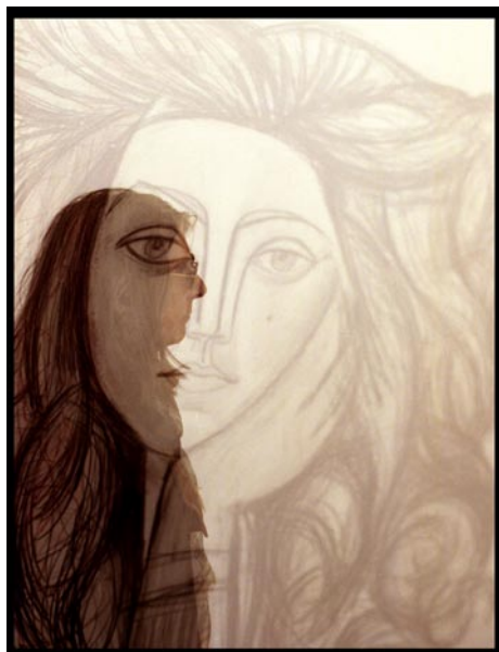
Work by Peter Filene

Filene has also been shooting straight photographs of peeling posters on city walls. "Partly buried faces, words, and patches of color break through the surface, creating ready-made collages. It's as if we're looking back in time, like the lay-