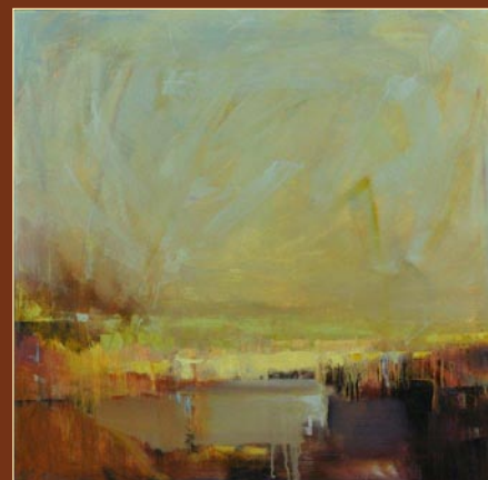
AdAlba oil on canvas 30" x 30"

www.LauraLiberatoreSzweda.net Contemporary Fine Art by appointment