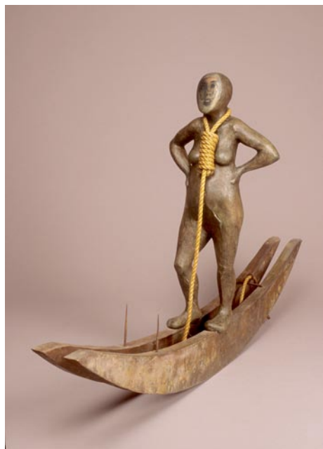
Work by Herb Parker

In Southern Gothic , Parker explores the nuances and incongruities of modern life through the conjoining of hand-crafted and found objects, which are used to create an assemblage-inspired installation. Surreal and often macabre, Parker's highly topical works are imbued with a sense of his own history, culture, and philosophies.