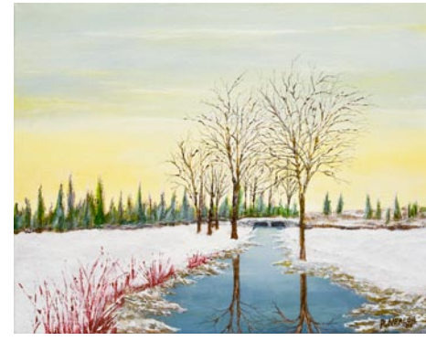
Work by Paul Nealon

For further information check our SC Institutional Gallery listings or call the Museum at 864/898-5963.