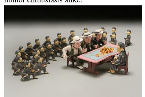
Final Showdown (Bonanza) by Russell Biles

What happens when professional craft artists are allowed to let loose - when they get to explore their mischievous and irreverent sides? Find out in this groundbreaking book, which, for the very first time, reveals an entirely different side of "serious" craft. Hundreds of images and essays from all over the world allow you to gain insight into the creative minds of contemporary artists like never before. A variety of traditional craft media are shown, such as furniture, ceramics, glass, fiber, jewelry, and metal, as well as a number of unique, nontraditional techniques. Even a bus shelter in London gets a creative make-over that's sure to make you smile! The topics range from the playful to the serious, but the message is always most enjoyable. Humor in Craft is a treasure trove for craft aficionados and humor enthusiasts alike.