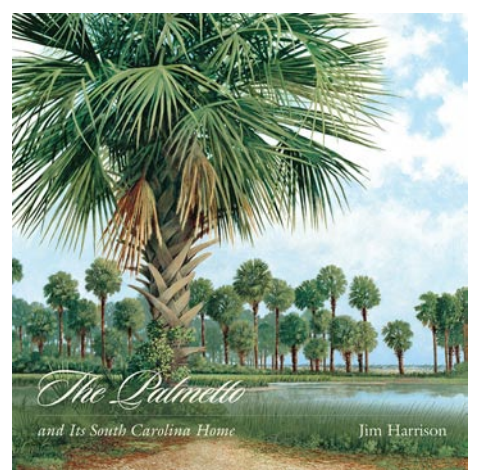
published by USC-Press

9 1/4 x 9 1/2, 96 pages, 56 color and 1 b&w illustration, ISBN 978-1-61117-049-8