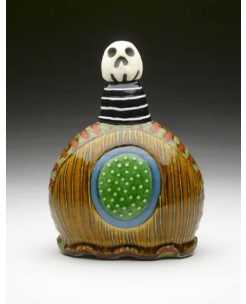
Work by Ronan Kyle Peterson

Clay in all forms, glass in all colors, hooked wall pieces, quilts, jewelry from metals, stones, gems, clays, woods, and polymers will all be offered. Wood boxes, bowls, furniture, lamps, photographs and paintings will also be on display, even