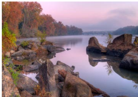
Work by Charles Hite

This exhibition is organized by the Cultural Council of Richland and Lexington Counties, in partnership with the Columbia Metropolitan Airport. Over 60 Midlands visual artists submitted work for