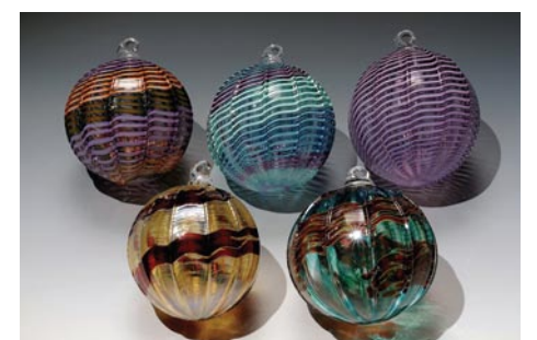
Work by Russell Glassworks

This popular sales show will feature more than 40 vendors with fabulous, one-of-a-kind items for everyone on your list, even your hardest to buy for. Set in the Center's historic Douglas-Reed House (ca. 1812), the show will feature a selection