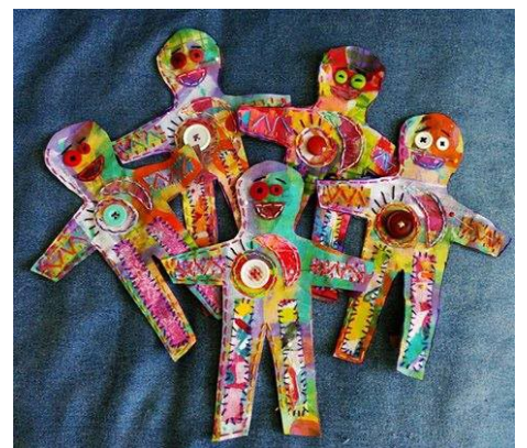
Who Doo Dolls in the process

their creative ideas, they decided that there should also be a line of Moonshine Who Doo's and Hippy Dippy Who Doo's. It probably won't stop there. Currently, the duo are trademarking and copywriting the Who Doo's. Developing an art line is all-consuming, but these artists are accustomed to wearing multiple hats as they handle both the creative and business sides of their partnership.