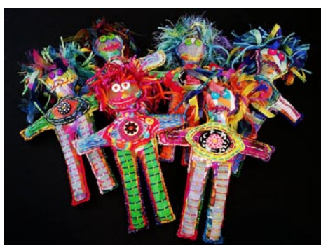
A generation of Who Doo Dolls

The two spun this legend of the Who Doo's: "Down in the Lowcountry of the Carolinas, deep in the salt water marshes, just as the pink and orange sunset touches the white egret's wings and the blue crab's claw, you may - if you're lucky - catch a glimpse of the Who Doo's skimming across the water's surface to tease the