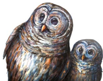
Work by Emma Skurnick

continued above on next column to the right