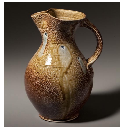
Work by Mark Hewitt

On the first weekend of the tour, a Gallery Show in Building 2 at Central Carolina Community College just West of downtown Pittsboro includes a piece of artwork from each artist on the tour. That's an excellent place to start. You can pick up a Studio Tour brochure there, and the rest is easy. Take a look at the map and make a plan. You might choose a place where several artists are clustered, or you can pick a few artists whose work you are particularly drawn to, and go there first.