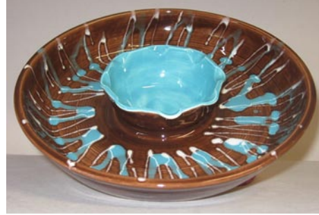
Work from Glazed Expressions