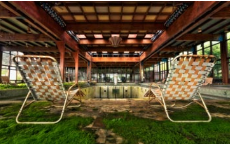
Work by Walter Arnold

to inspire a short film When You Find Me . Howard chose the photograph out of almost 100,000 other entries to craft the setting of the movie.