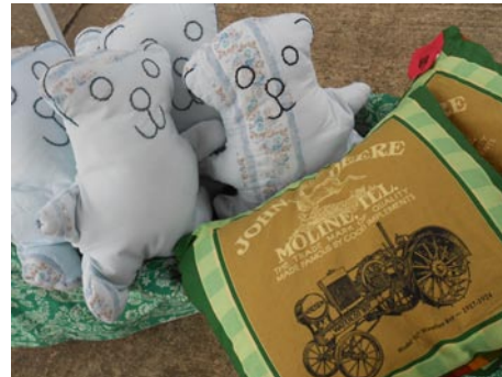
Work by Rockin Rays

If your holiday list has you searching for unique gifts, the Artisans Holiday Market on Dec. 3, 2016, is your one-stop shopping destination. For the fourth year, Avant Garde Center for the Arts will bring together an impressive list of artisans from throughout the Carolinas - all under one roof, in Lancaster, SC, from 10am until 4pm. Visitors will find free admission and trolley service to convenient parking. Artisans will be on hand selling original handcrafted wares, authors will host book signings, and door prizes will be given away throughout the day.