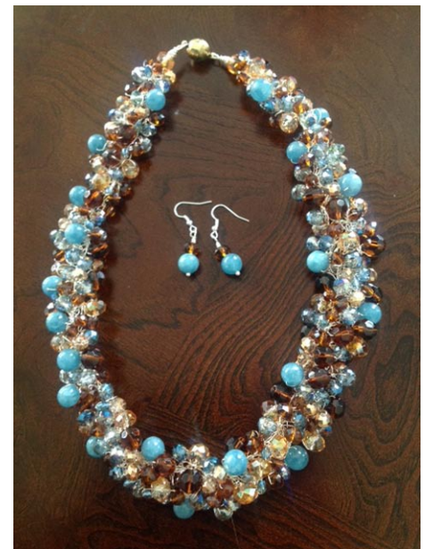
Works from Lord and London

This book will make a great gift to any artist, a person who loves art or anyone who just loves to read what real people have to say.