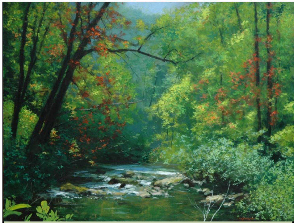
Late Summer on the Chattooga River

The Jazz Loft Project: W. Eugene Smith in New York City, 1957-1965 was organized by the Center for Documentary Studies at Duke University, the Center for Creative Photography at the University of Arizona and the Nasher Museum of Art at