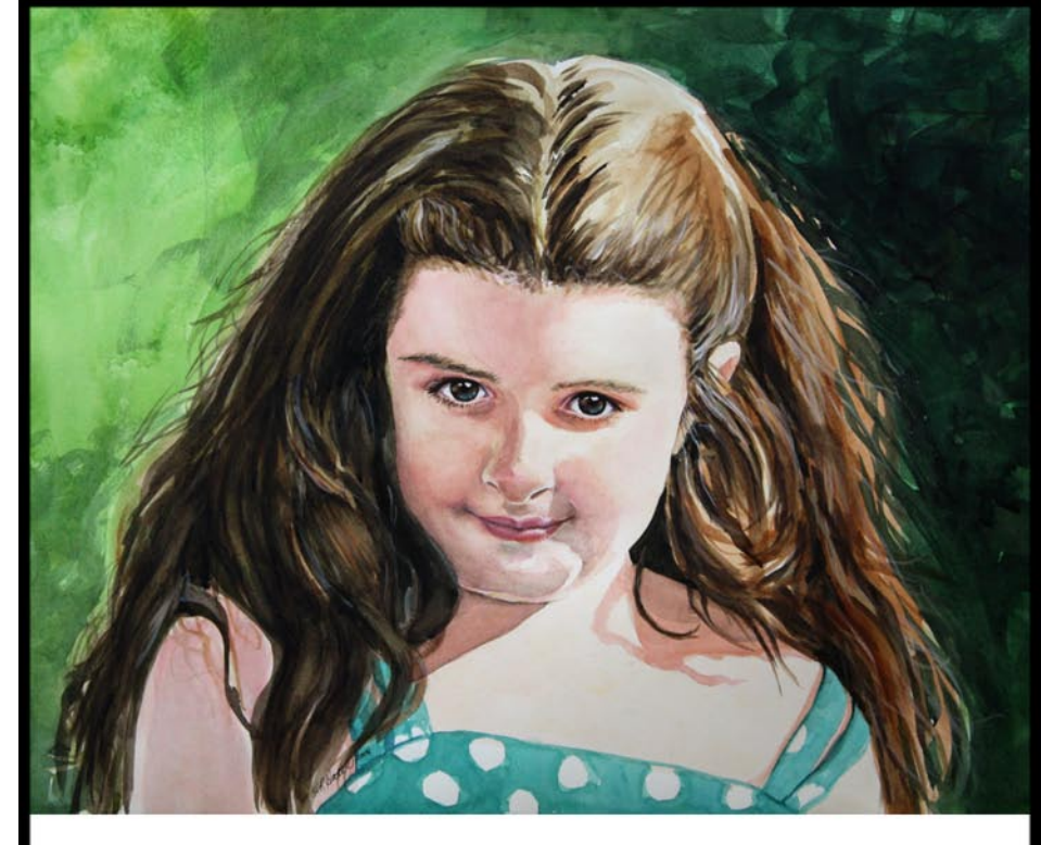
Kaitlyn • watercolor • 16" x 20"

Visit (www.potteryofbusbeeroad.com) for direct links to the individual pottery websites. You can pick up the brochure for the Busbee Road section of the Seagrove pottery area at the NC Pottery Center, all NC Welcome Centers and at any of the shops along Busbee Road.