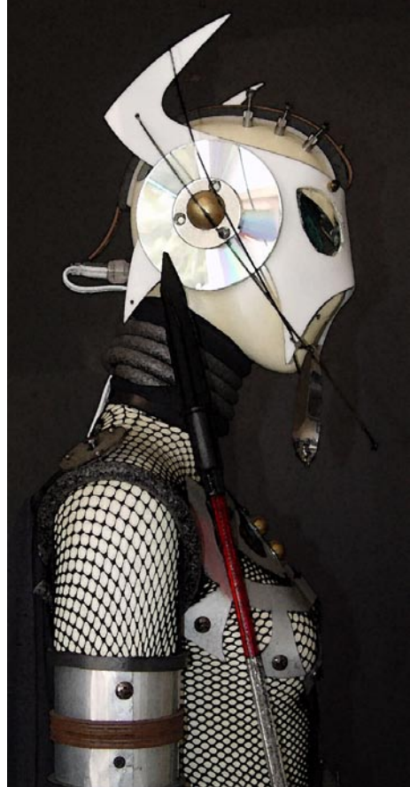
Work by David Cianni

701 Center for Contemporary Art in Columbia, SC, is proud to present Faster Forward , an exhibition highlighting the work of 10 artists from Israel, Canada, Spain, United Kingdom and the United States whose new media, experimental film and video works explore contemporary visual culture mediated through popular technologies. The exhibition will be on view through Mar. 4, 2012.