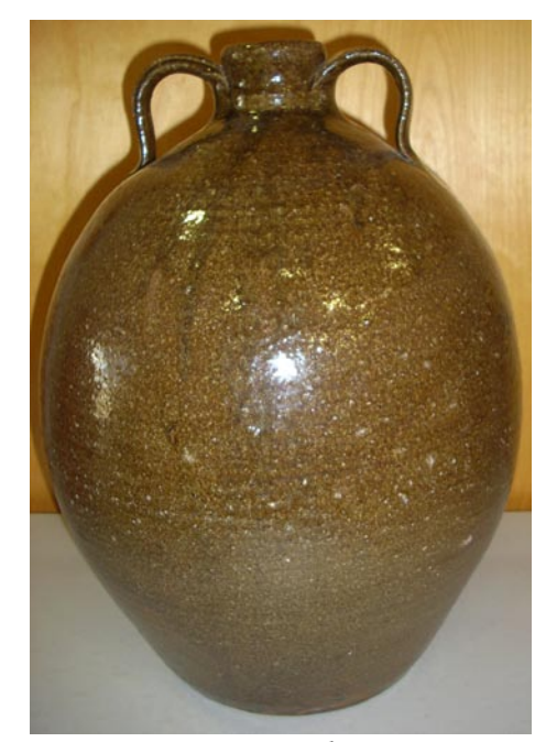
Unsigned, marked "V" from the Catawba Valley Region