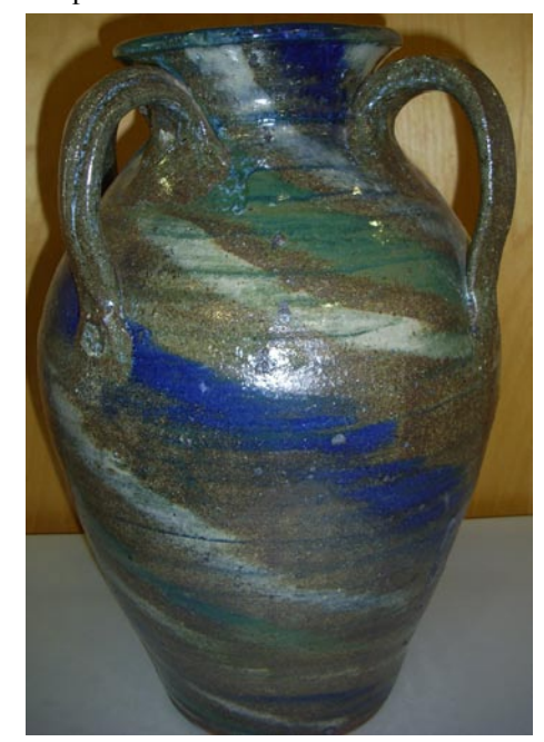
Work by Burlon Craig

to educate and connect people with potters and pots.