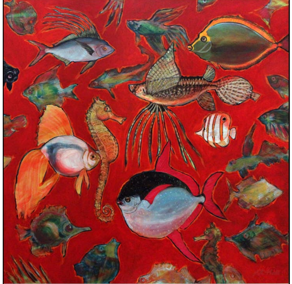
The Red Sea • acrylic on canvas • 60" x 60"