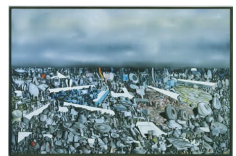
Yves Tanguy, Multiplication of the Arcs, 1954, Oil on canvas. The Museum of Modern Art, New York, Mrs. Simon Guggenheim Fund, 559.1954

Double Solitaire: The Surreal Worlds of Kay Sage and Yves Tanguy explores the exchange of ideas that informed the work of the important Surrealist artists Kay Sage and Yves Tanguy during their fifteenyear relationship. It is the first exhibition of Surrealist art for The Mint Museum; the first major exhibition of Surrealism in the region; and the first anywhere to examine Sage and Tanguy's work from this perspective.