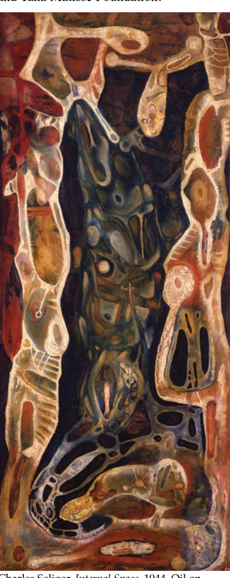
Charles Seliger, Internal Space, 1944, Oil on canvas, 36 x 15 inches. Estate of Charles Seliger, Courtesy of Michael Rosenfeld Gallery LLC,

The exhibition was made possible through support from The Mint Museum Auxiliary and awards from the National Endowment for the Arts and the Pierre and Tana Matisse Foundation.