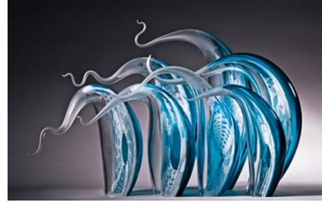
Work by Rick Eggert

The exhibit explores the evolution of form over time as it occurs in nature. The Bender Gallery is the only gallery in North Carolina dedicated exclusively to studio art glass and houses the region's largest glass art collection.