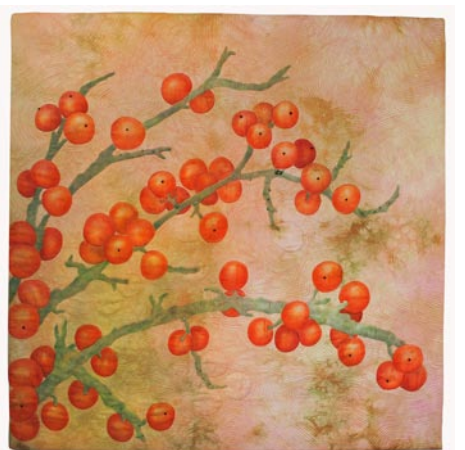
Work by Nancy Cook

The exhibition features layers of fabric, ink and thread to depict the intricate details found in the minutiae of nature. Working directly from collected seed specimens, Cook's designs are based on research and sketching to clarify the architectural uniqueness of each species. Her hand-guided machine quilting creates lines and texture reminiscent of bas relief sculpture. Her current series, Seed Play , focuses on plant seeds and fruits as metaphors for life's riches. The series began with a focus on trees, but more recent