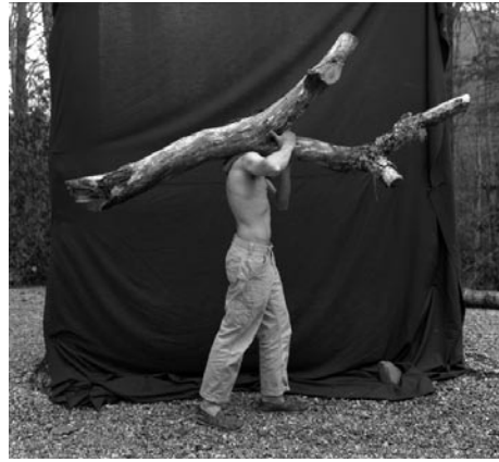
Work by Anderson Wrangle

Fascinated with photography since a teenager, Wrangle works primarily with large format film cameras. The images in the exhibition were captured with the Deardorff 5x7 and Rollei cameras. The black and white gelatin silver prints range from large mural prints to highly detailed 5x7-inch contact prints. In addition to his wide-ranging photographic explorations, the artist uses sculpture, performance, woodworking and boatbuilding. The