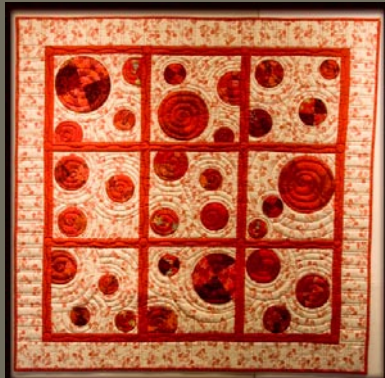
Through February 23, 2013 Winter Heat: Not Your Grandmother's Quilt