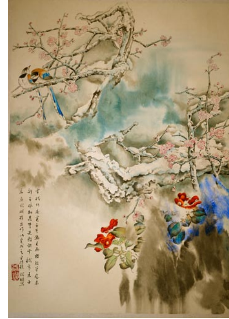
Work by Viven WuShaun Burns

ing photographs from the local Alamance area. All of the images presented were captured digitally with Canon professional cameras and lenses. They have been subjected to minimal digital manipulation, most of which is intended to reproduce classic darkroom techniques. They are printed on 100-year archival Kodak photographic paper using the traditional silver halide photographic process, which gives them a luminosity and longevity not to be found with inkjet reproduction.