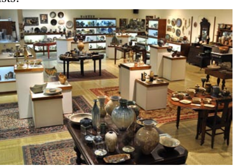
View inside Pottery Road Studio

Pottery Road Studio & Gallery is fairly new to Seagrove, but Don and Susan Walton, the potters who run the gallery are not newcomers by any means. The shop is located at 1387 Highway 705 South, the same location that housed Walton's Pottery for many years before the Waltons took some time away from pottery to focus on another creative business, Rubber Stamp Tapestry. Pottery Road Studio is now home to both Walton's Pottery and Rubber Stamp Tapestry, and also features functional and contemporary pottery created by other artists.